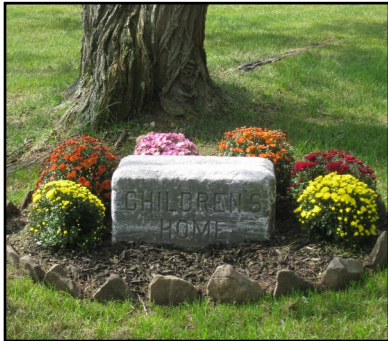
Children's Home Carriage Stepping Stone