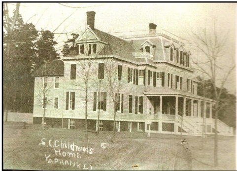
Suffolk County Children's Home