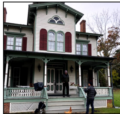
Filming on location at the Hawkins House