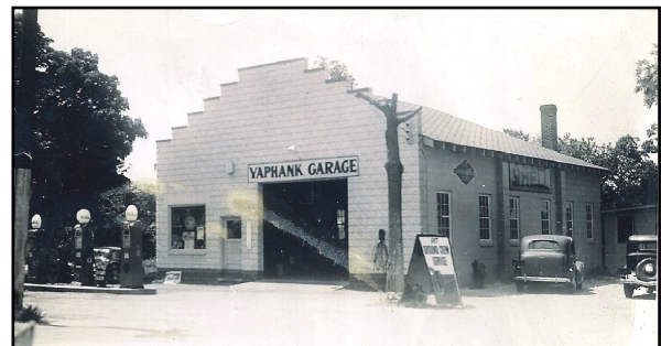
Yaphank Garage, 'back in the day'...