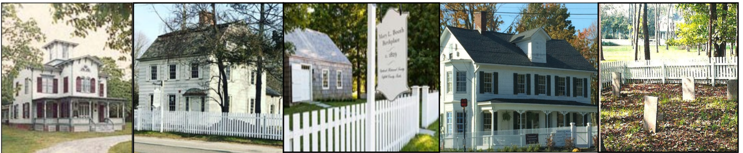
All of the above structures and sites would become part of the Yaphank Historic District National Register Listing, along with most structures noted on the map below.

*Note: Preserve New York is a signature grant program of the New York State Council on the Arts and the Preservation League of New York State. Preserve New York is made possible with the support of Governor Andrew M. Cuomo and the New York State Legislature. Generous additional support has been provided by the Robert David Lion Gardner Foundation for the projects in Nassau and Suffolk County.