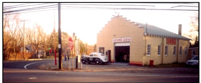
Period police car at the Yaphank Garage in 2004.

Years passed and the Suffolk County Police replaced local Brookhaven Town Constables. The old Yaphank Garage was condemned for a road widening project that never came to pass. But that's not the end to this story. The Suffolk County Police Historical Society has restored the Yaphank Garage. Mannequins and display boards tell the story of how a small community service station and its local Constable worked together to serve their citizens in the 1930's and 40's.