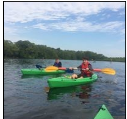
Happy kayakers on Willow Lake

Collaborative efforts between the Town of Brookhaven, the Yaphank Historical Society and the Coalition to Save the Yaphank Lakes have resulted in major improvements to the Town Park fronting the Willow Lake. A boardwalk is under construction to link the Park, the Swezey-Avey House, headquarters of the Historical Society, and the lake-front access area for fishing. The Lake was recently dredged to eliminate much of the invasive aquatic plant material which was choking good fishing beds, and several kayak launching areas have been improved. A new spillway has been built and a fish ladder incorporated into the design. New playground equipment and picnic tables have been installed in the Park, as well as fencing and landscaping. Two lending libraries and a bulletin board greet visitors. And a small sandy beach serves swimmers.