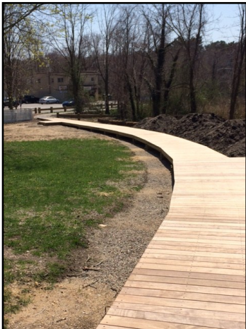
New boardwalk from Swezey-Avey House to spillway under construction

Various owners kept these mills active over the next 150 years and Yaphank continued to grow and prosper. Over time water-powered mills became obsolete. Eventually both Yaphank mill complexes burned in the early 1900s. However, the lakes remained and continued to be a draw for our residents and for visitors from the City who wanted to escape the heat and fast pace of city life. A booming tourist business replaced the milling industry. Both the city visitors and our own community members enjoyed the summer breezes, and also the swimming, fishing and boating afforded by Willow and Lily Lakes. Yaphank today still offers scenic views and summer breezes. Our Lakes still provide recreation for our families and visitors just as they did two hundred years ago.