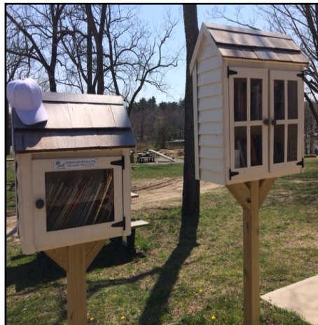
Mini-library kiosks at entrance to playground