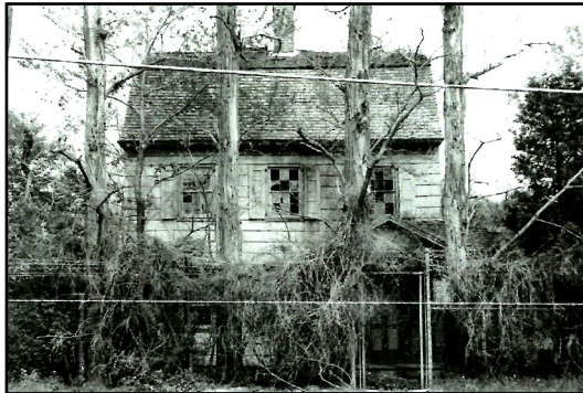
The Homan-Gerard House, May 1962.

Our restoration of the Homan-Gerard House in Yaphank has been recognized by Preservation Long Island and featured in their recent newsletter Preservation Notes . The group, in partnership with the Yaphank Historical Society and Suffolk County Parks Historic Services hosted a behind-the-scenes tour at the House on April 14, 2018. The tour highlighted recent renovation work at the property. Their newsletter cover showed before (1962) and after (2018) pictures of the Homan-Gerard House. Several other pictures of the House and the tour group also appeared in the issue.