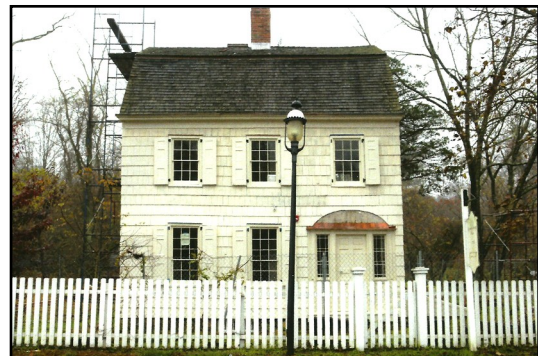
The Homan-Gerard House, October 2018.