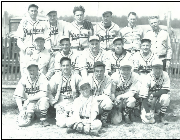
This mid-to-late 1930's picture from the Society archives shows one of The Yaphank Nine teams.

During the summers of 1935 through 1938, the local sports pages were full of praise for the very successful Yaphank baseball team. Yes, they lost once in a while, but they usually won their game, even if only by a hotly contested single point in the last inning. Several players remained on the team's roster throughout all four years, but new members joined, obviously wanting to join a winning team. The Mid-Island Mail Newspaper sports coverage always included the players' names and positions along with detailed game stats for the current game. It seems the team had a variety of team names over the earlier years, but during the period discussed here, they were known as The Yaphank Nine.