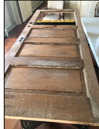
One of the vintage doors has been repaired to include an upper panel of glass and installed as the entrance to our archive room. After painting, stenciling will be applied to the glass indicating Yaphank Historical Society Archives.