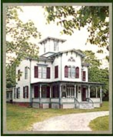
Robert Hawkins House P.O. Box 111 Yaphank, NY 11980-0111 www.yaphankhistorical.org

631-924-4803 -Swezey-Avey House Main Office