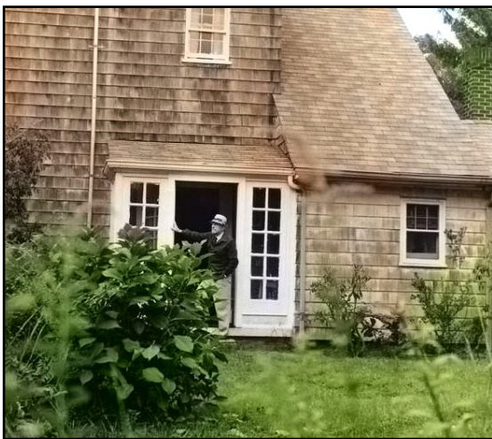
Kovarik House, on East Main St.