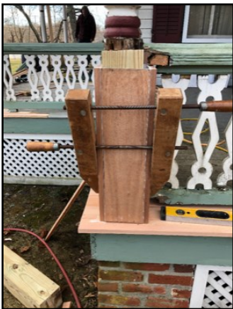
Repairs to the Hawkins House front porch. Rot and insect damaged areas are being completely replaced. Jeremiah McGiff, Restoration Carpenter, is heading up this project.