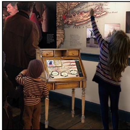
Example of Interactive Visitor Guide