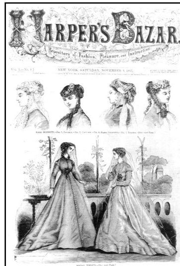
Cover of first issue, November 1867.

Orientalism, and then the new epoch of the aesthetic of photography."