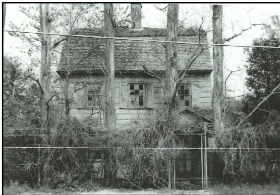
The Homan-Gerard House, May 1962