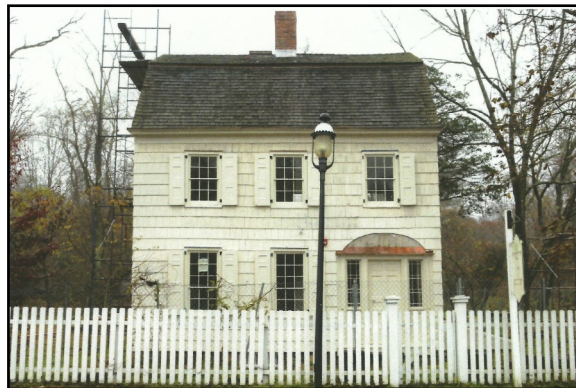
The Homan-Gerard House, October 2018